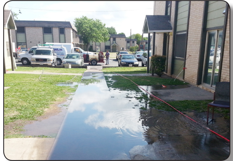
Sewage overflow at an Austin apartment complex.

Austin Water will attempt to assist you with the sewage overflow issue. However, our actions to stop the overflow may not correct the problem. Sewage overflows are often the result of old or defective private plumbing which can include broken pipes, blockages caused by grease and other materials. When this happens, customers are required to obtain a plumbing permit and repair or replace their private wastewater line. For information regarding permitting requirements and financial assistance options, contact the Private Lateral Program at 512-972-0069.