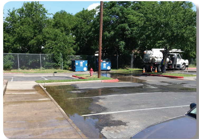
Sewage overflows are a threat to human health and can negatively impact to the value of your property.