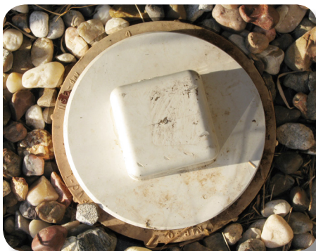
The property owner's cleanout cover is typically 4" in diameter.

It is important to know where your property clean out is located. Refer to diagram on other side. In the event of a sewer overflow you should stop using any water, contact the Austin Water Dispatch Office at 512-972-1000, and remove the clean out cap to reduce pressure and minimize sewage back-ups into your home or property. If possible, divert active sewage overflows away from any storm drains or where it can reach waterways.