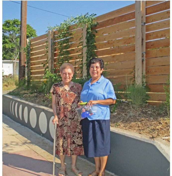
Community members who live near the Green Alley Demonstration Project

to the Austin community and inform policy and regulatory requirements.