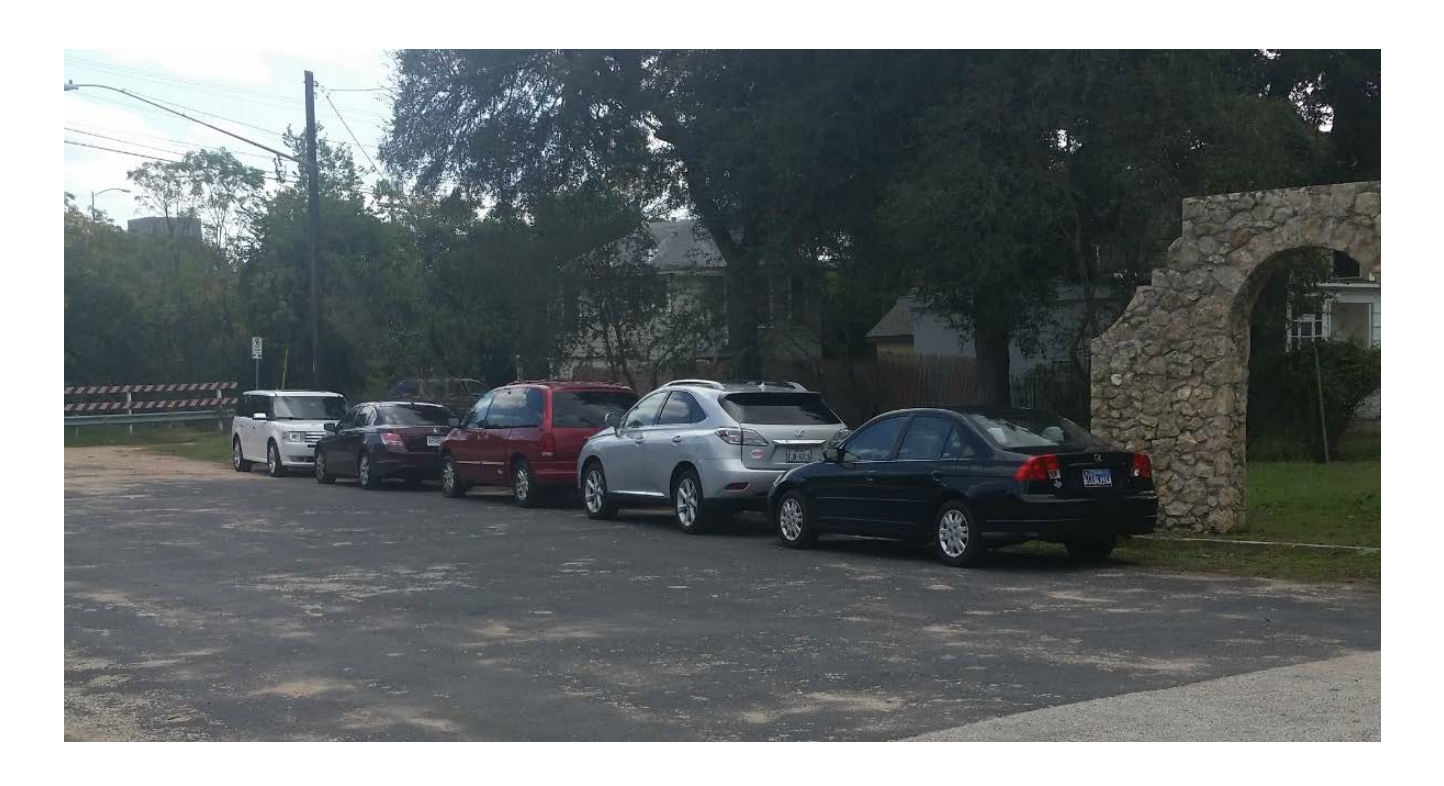
Proposed Layout for Pease Park at Kingsbury