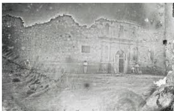
The Alamo, 1849.