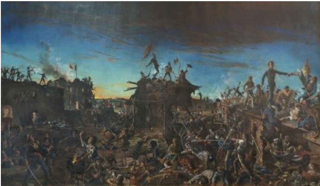
Dawn of the Alamo, Henry Arthur McArdle.