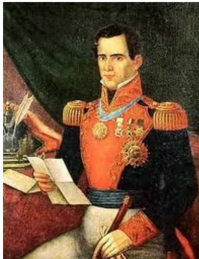
Santa Anna in Military Uniform.