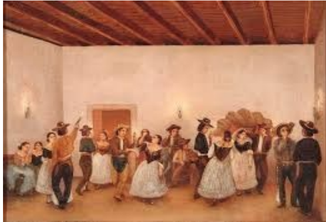
"Fandango" by Theodore Gentilz, 1860's, similar to the one Travis hosted to celebrate the birth of George Washington. Daughters of the Republic of Texas Library at the Alamo, San Antonio.