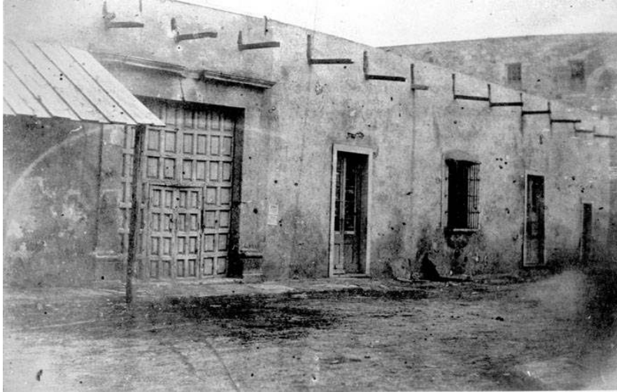
Veramendi Building on Soledad Street built in 1716. Photo from the 1860's.

The Veramendi Palace served as the Governor's Palace in 1832 and 1833 when Juan Martín Veramendi became the governor of Coahuila y Tejas. Located on Calle Soledad between present-day Commerce and Houston Streets, this home was the site of any diplomatic missions to the region or governmental functions. (1) From the 1820s through the 30s, the population of Anglo settlers in Béxar expanded dramatically from around 5,000 to 20,000 (including enslaved people) while the native Mexican (Tejano) population remained around 4,000. (4)