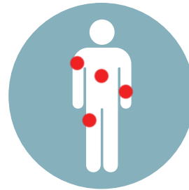
Muscle aches and backache