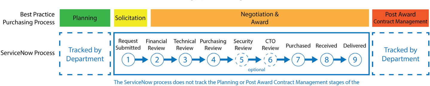
Exhibit 2: CTM's tool does not track information from all four phases of the technology purchasing process